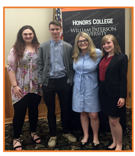
Clinical and Neuropsychology Track presenters.